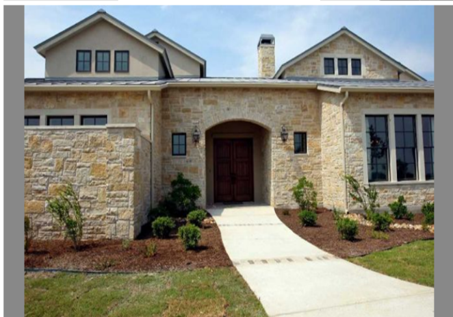
FOR REAL ESTATE - A view of the Mattern & FitzGerald Custom Builders home at 140 Bitter Springs Monday May 9, 2011 in the Menger Springs community of Boerne, Tx.