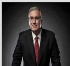
It's 'Countdown' time for Keith Olbermann